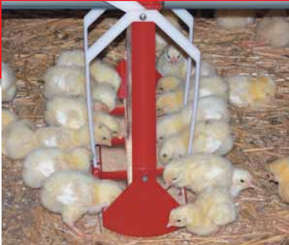
Day old birds eat from a low, narrow tray.