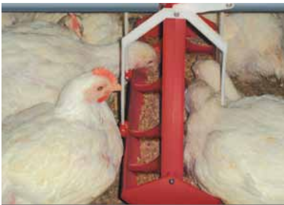
Older birds eat from a deeper, wider tray.